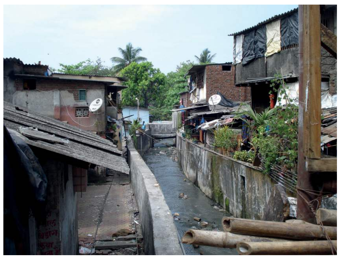
Photograph A for Question 3(a).